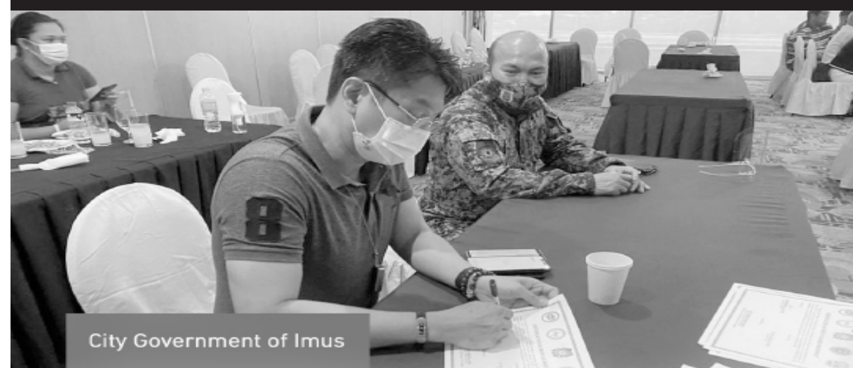
City Government of Imus