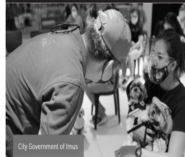
City Government of Imus